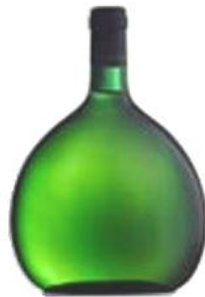
Figure III.1 A bocksbeutel bottle.