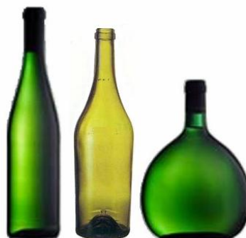
Figure IV.3 Flûte d'Alsace , Clavelin and Bocksbeutel or Cantil .

that they may be regarded as indirect GIs or indirect simple GIs. 241 For example the traditional term Claret may be regarded as an indirect GI for red quality wines from Bordeaux.