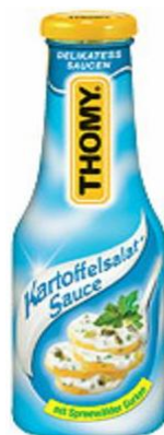
Figure V.3 Use of Spreewälder Gurken on Thomy potato-salad sauce.

To the similar effect is also a more recent case decided under the 1992 Origin Regulation in Germany. 367 The defendant, an affiliate company of Nestle, had sold a potato-salad sauce under the name ' Kartoffelsalat-Sauce mit Spreewälder Gurken '. 368 The plaintiff, an Association for Spreewälder Gurken , sought an injunctive relief against the company. Landgericht Berlin (District Court) held that by displaying prominently and in an eye-catching manner the words Spreewälder Gurken on the product package the defendant had exploited the excellent reputation of the PGI in breach of the 1992 Origin Regulation. The Court found it irrelevant for the determination of the case that the product actually contained Spreewälder Gurken gherkins. Accordingly, only undertakings meeting the specifications can use the geographical indication with a reputation.