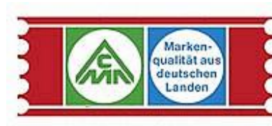
Figure III.2 German quality product label.

The ECJ dismissed the arguments of the German Government and ruled that a designation referring to the whole of Germany as the area of provenance and applying to all agricultural and food products fulfilling certain quality requirement cannot be considered a geographical indication. 207