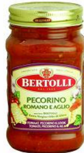
Figure V.1 Use of Pecorino Romano on Bertolli pasta sauce.

the product contains Pecorino Romano cheese to avoid misuse? Even if consumers are not misled, is it not almost certain that the words and the pictures on the label call the renowned Italian cheese into the minds of consumers and thereby establish a reference to the protected designation? Would this not be evocation?